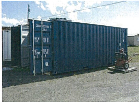
2010 New Conex Location

ADEC Fairbanks Responders 451-2121 After Hours call 1-800-478-9300